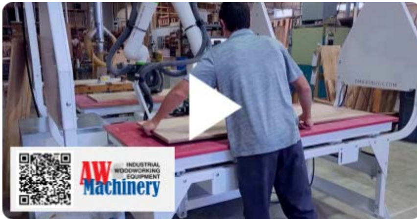
Video interview courtesy of our trusted distributor, AW Machinery.