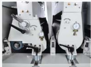
Accurate adjustment of each drum and platen