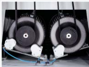
Automatic disc brakes for sanding heads