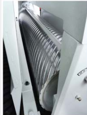
Steel contact drum with micro adjustment