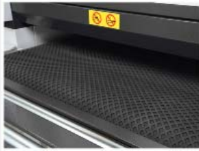
High quality rubber conveyor belt