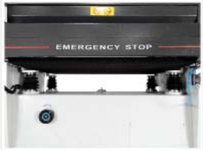
Four table elevation jack screws and emergency stop bump bar