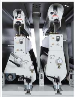
Contact drum and combination sanding heads