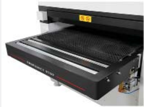
Dual infeed bed rollers and pneumatic conveyor belt tracking cylinder

The Cantek PS Series Widebelt Sanders combine a solid machine frame with unparalleled machine features resulting in superior sanding quality & reliability. The dual sanding heads result in less passes through the sander resulting in increased efficiency and throughput. The first sanding head is a steel contact drum with superior calibration capacities and durability. The second head consists of a versatile combination head with rubber contact drum and adjustable sanding platen to perform further calibration or finish sanding with finer sanding grits. The 75" long belts allow for longer runs between belt changes. The quick setting digital thickness control allows for accurate, automatic adjustment of the table for precise sanding results.