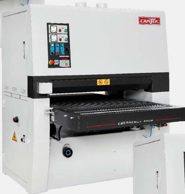
PS52DA 52" WIDEBELT SANDER