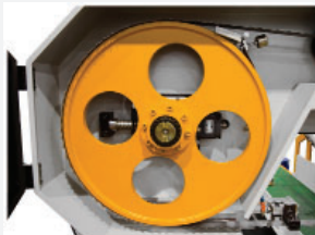
Solid steel bandwheels