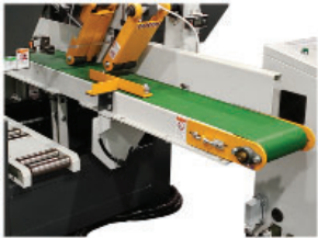
Urethane feed conveyor

The Cantek HR300PBX tilting bed horizontal band resaw is industrially built for demanding resawing applications. The bed can be tilting from 0–45° making it ideal for bevel siding, moulding blanks, or millwork components. Capable of feeding up to 12" x 12" timber and cutting up to 10" thick. The powerful 30HP saw motor has a variable feed control allowing you to match the cutting speed to your blade & application requirements. The HR300PBX runs a 2" wide blade which runs on solid steel band wheels which are precision machined and balanced for a smooth cutting action. The precision sandwich style blade guides ensure the blade runs true for optimum cutting results. The thickness is conveniently adjusted using a precision motorized digital thickness control.