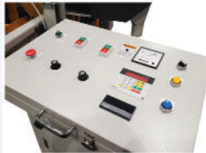
Mobile control panel