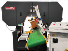
45 degree tilt