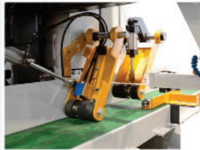
Pneumatic top hold down pressure rollers