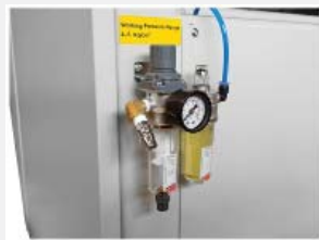
High quality Camozzi pneumatics