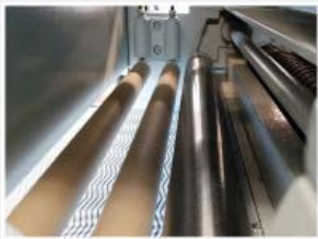
Dual rubber pinch rollers for superior part hold down