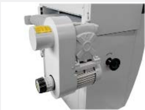
Variable speed motor