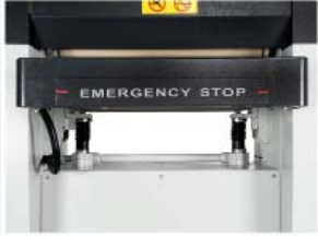
Two elevation screws

The Cantek C251 24" Widebelt Sander is compact and versatile with a combination sanding unit for calibration and final sanding. The robust sanding unit and heavy-duty frame ensures optimum sanding results. Motorized thickness adjustment with digital thickness control for fast and accurate table adjustment.