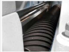
3 3/8" sanding contact drum