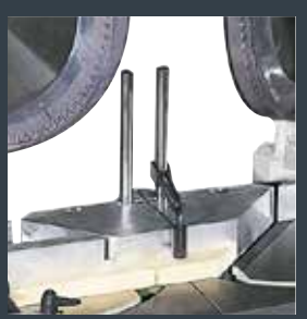
Brackets for short pieces.