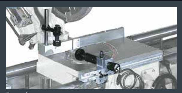
for a better holding of the pieces during the cut.