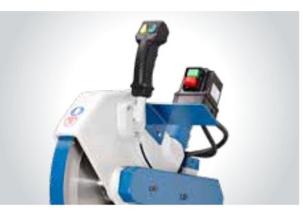
Quick swivelling with pneum. locking