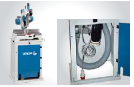
Dust collecting cabinet