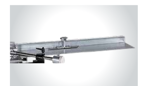
Set of scaled tables - Support to join scaled tables to cabinet - Nylon flip-over stop - Plexi flip-over stop