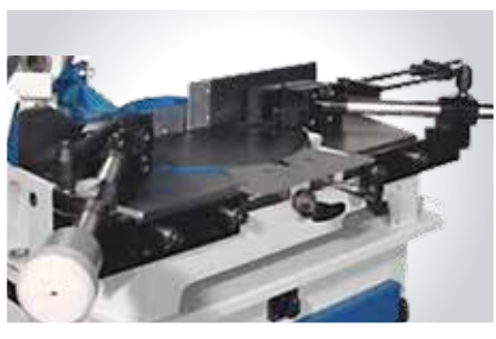
Double horizontal clamps: 45° mechanical with foot-pedal 45° pneumatic with foot-pedal 90° pneumatic with lever