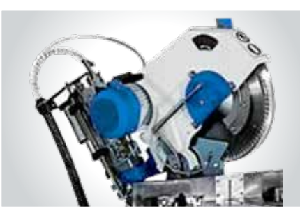
Oil-pneumatic feed of head