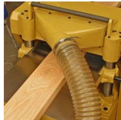
The dust chute angles the 4"-diameter port to the side so the hose does not hang in the way of the wood as it exits from under the cutterhead.

The POWERMATIC 15HH generates large quantities of dust and chips that must be evacuated to maintain performance at the cutterhead. The efficiency of the POWERMATIC 15HH doesn't reduce that quantity though its cutting action does tend to produce smaller particles than a long knife machine. We recommend a 500-600CFM (cubic feet per minute minimum) dust collector to handle the flow of chips properly.