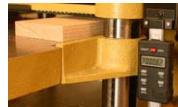
Adding the Digital Readout Scale brings a new level of precision to the 15HH.

The DRO has built-in modes that make many planning tasks easier and dead on accurate. It can also be changed to display inch or