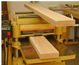
A pair of rollers on the top of the 15HH makes returning heavy stock for a second cut simple and safe.

The smooth surface of cast iron extension tables makes it easier to introduce wood into the machine, particularly when "training" one piece against the end of the one before it. They also eliminate the possibility of pinching a finger between the stock and a roller as the stock exits the machine.