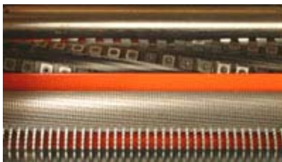
A special serrated infeed roller keeps the stock moving consistently under the cutterhead. A smooth steel outfeed roller helps the wood exit without damage to the freshly planed surface.

The POWERMATIC 15HH has two material feed rates –20 FPM (Feet Per Minute) used primarily for rough dimensioning and 16 FPM to increase the cuts-per-inch to create a silky-smooth surface. A push/pull knob shifts between the feed rates on the fly. The rollers are driven by a gear and chain drive with an automatic chain tensioner, housed in a cast iron case. The gear section runs in an industrial style oil bath for maximum control over long-term wear.