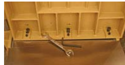
The cast iron extension tables have setscrew adjusters built into their mounts that make leveling them to the primary table simple and fast.

A pair of rollers set into the primary table surface below the cutterhead help maintain smooth movement of rough stock through the POWERMATIC 15HH. The above table height of the rollers is easily adjustable.