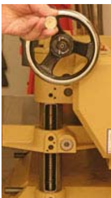
Table height is adjusted with a large (left) cast iron handwheel with a spinner knob. A pair of locking knobs (right) one at each end of the table locks it in position firmly. These locking knobs can be moved to the opposite side of the 15HH if space is an issue.